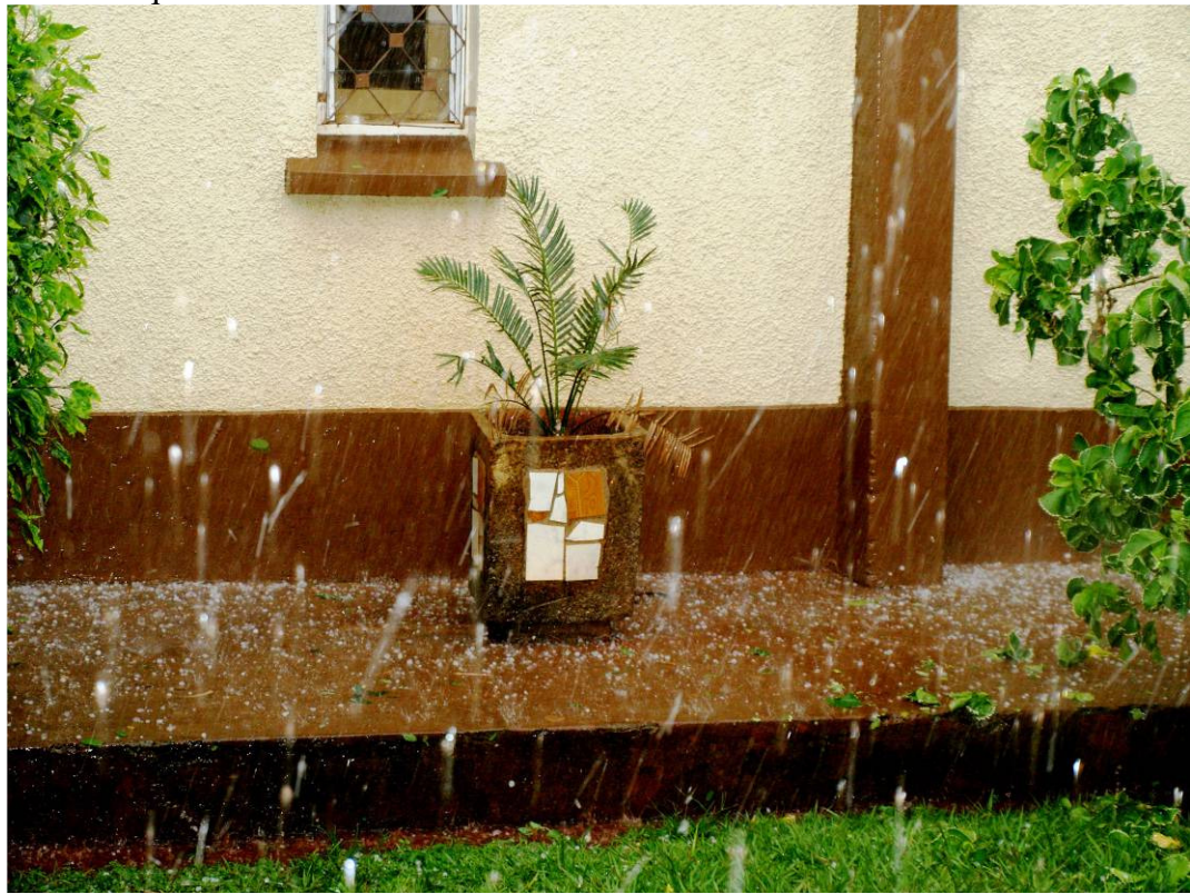
Can you believe this hail? We have lived here 27 years and we never had this much hail before in Jinja. This came in February and then again in March. Each time the electrical voltage for UBS surged to over 600 volts, blowing out anything