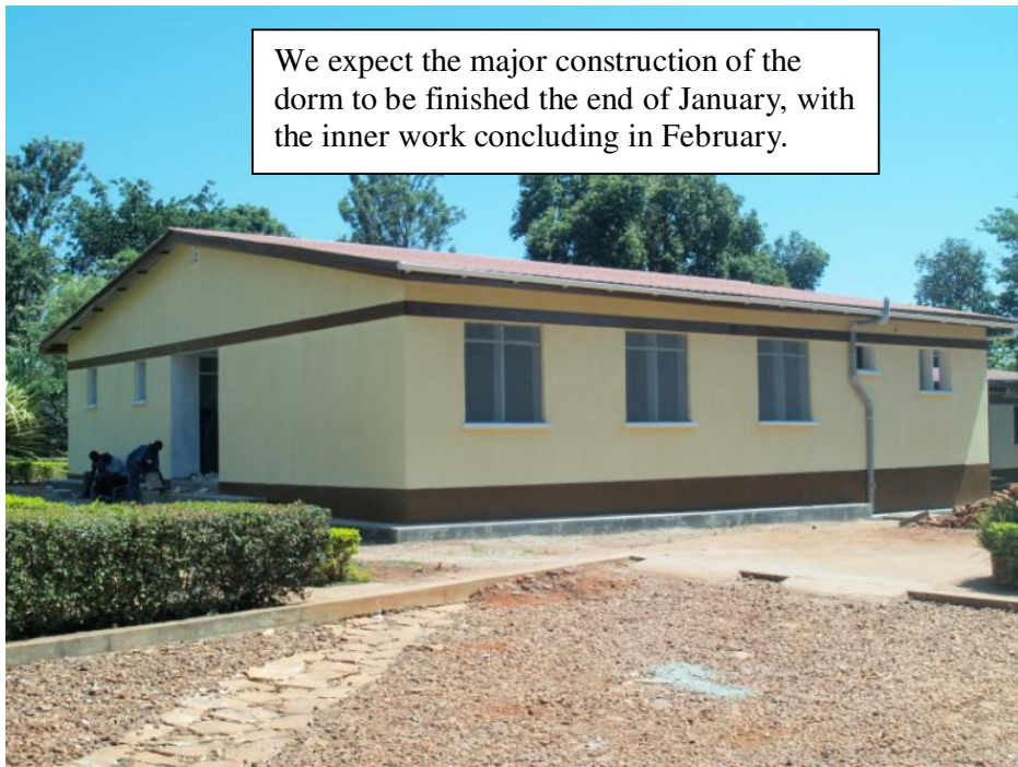
Looking at the new dorm the end of January. Below is the future building site.

We expect the major construction of the dorm to be finished the end of January, with the inner work concluding in February.