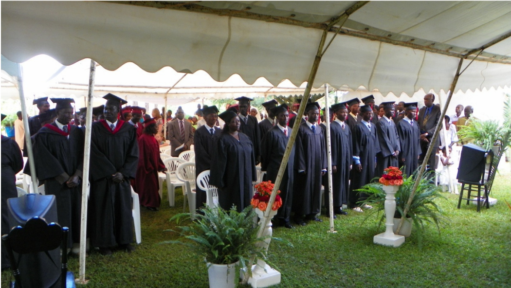
Thirty-nine students graduated under the tents which UBS rented in Jinja.