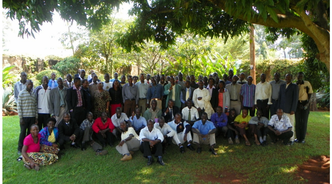
UBS June students: Certificate 13, 14, and 15 classes plus Diploma 25 class. Seventy -five students attended UBS this month.

Uganda National Council of Higher Education licensed the UBS Diploma program in 2006. They awarded UBS the Certificate of Classification and Registration in 2010. That means UBS is fully accredited for Diploma education. UBS has begun the process for one degree accreditation.