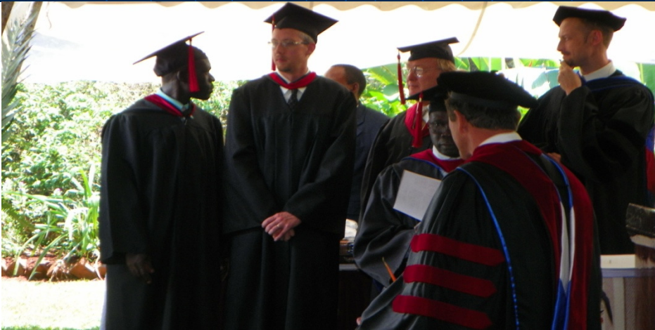
UBS is getting some height in the faculty members.