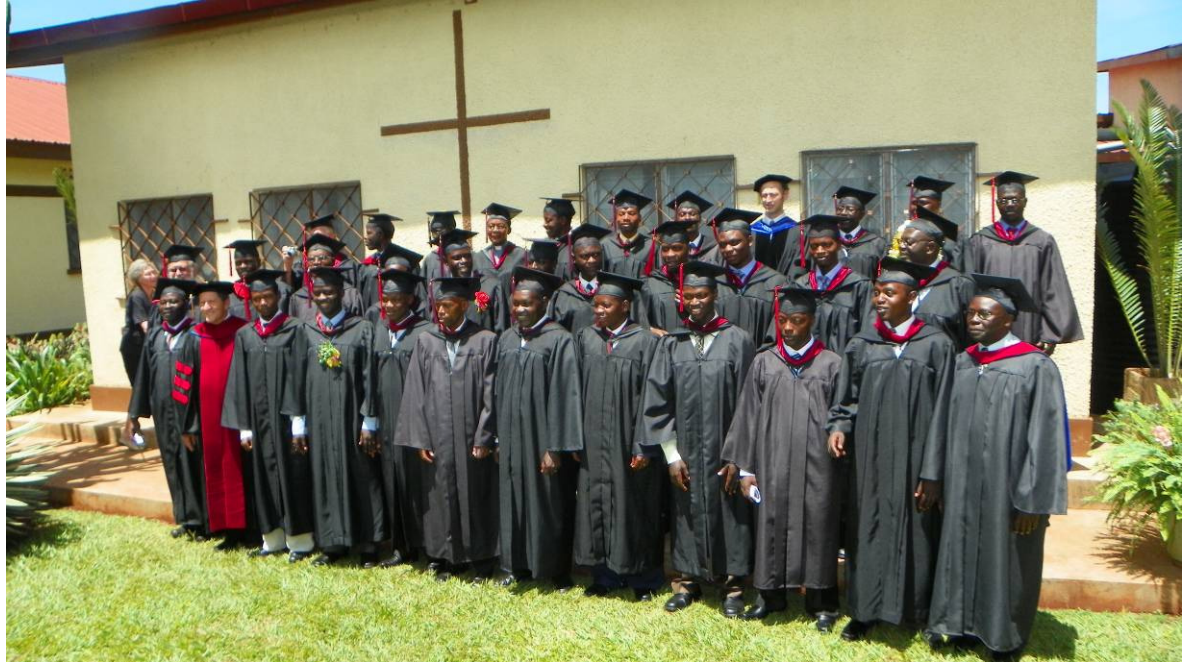
Advanced Diploma 5 and 6 classes graduated with twenty-six on Friday April 26.