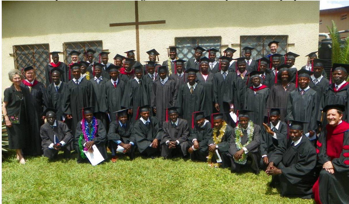
Diploma Classes 22 and 23 graduated with forty on Saturday April 27 - above. Below - The twenty-fifth anniversary of UBS was recognized with the Principal and Nurse honored as being there from the beginning in 1988. The Academic Dean spoke to that perseverance just before the Principal gave the history of UBS.