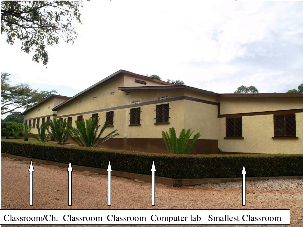
Classroom/Ch. Classroom Classroom Computer lab Smallest Classroom

This is the long side from the opposite end of the first campus photo. This view is from the parking space looking to the front and drive side of the campus.