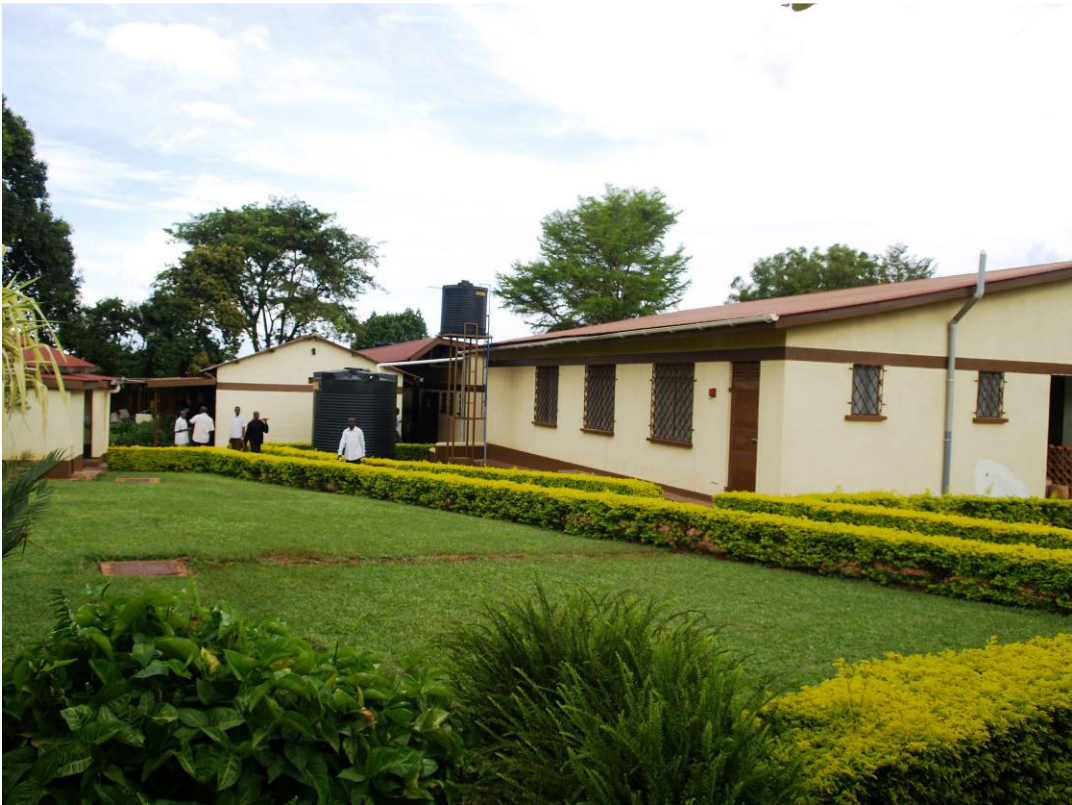
Behind the Admin/Classroom building and the Library are the three dormitories with capacity for one hundred and forty-four students.

USA Contact for UBS: Jim Benham jtbenham@cox.net